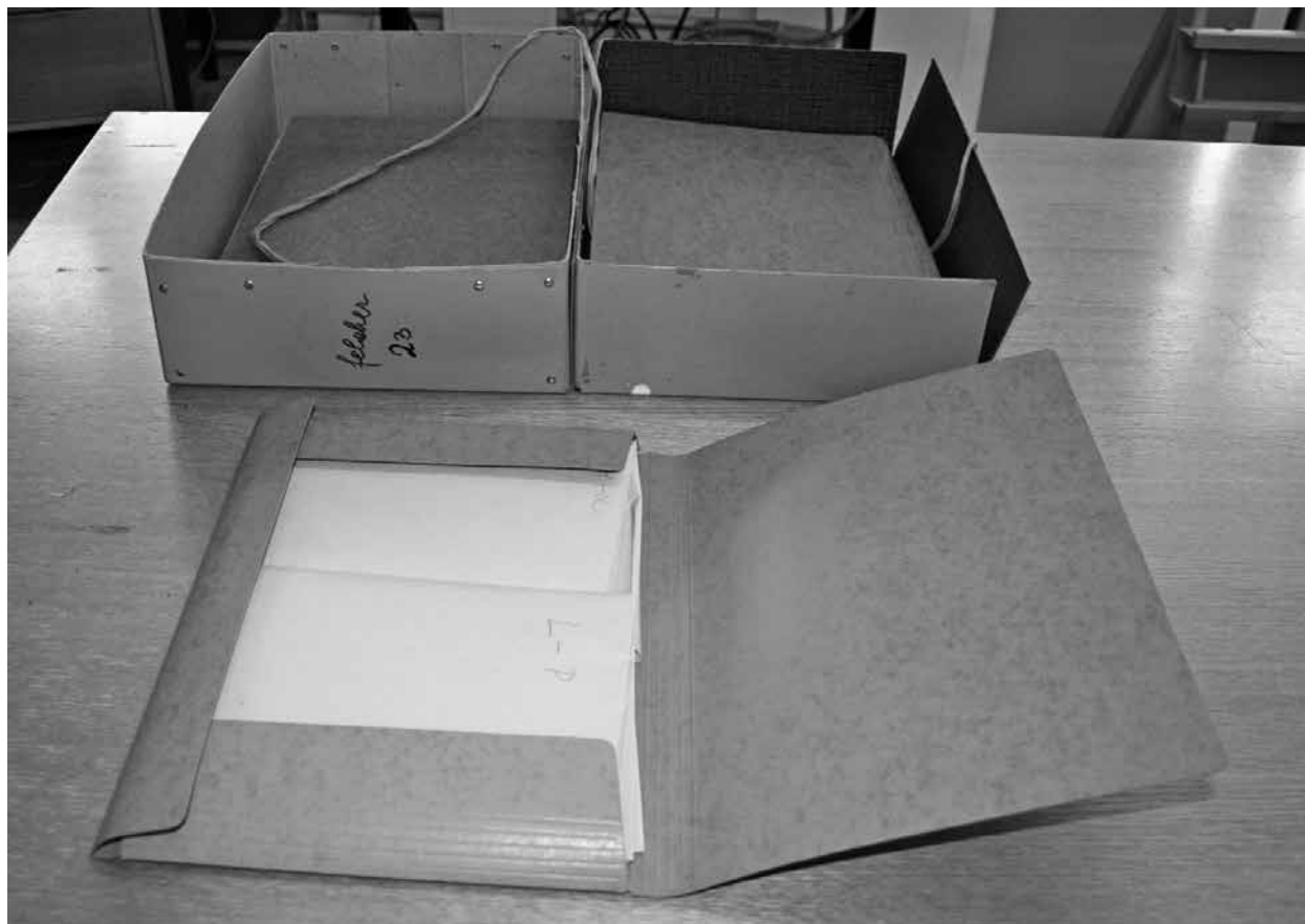
Figure 2: The photographs after being properly arranged: the archival box with open blue paperboard folder and the photographs placed in the letter envelopes

arranged, but most often they were simply tied up in bundles with other materials (see Fig. 2). When arranging and taking the inventory in the Archives, the material concerned and the photographs were stored in the aforementioned archival boxes; within the boxes, materials were subdivided and placed in paperboard flap folders, size A4, which are convenient for document filing. The photographs were put in letter envelopes for better protection.