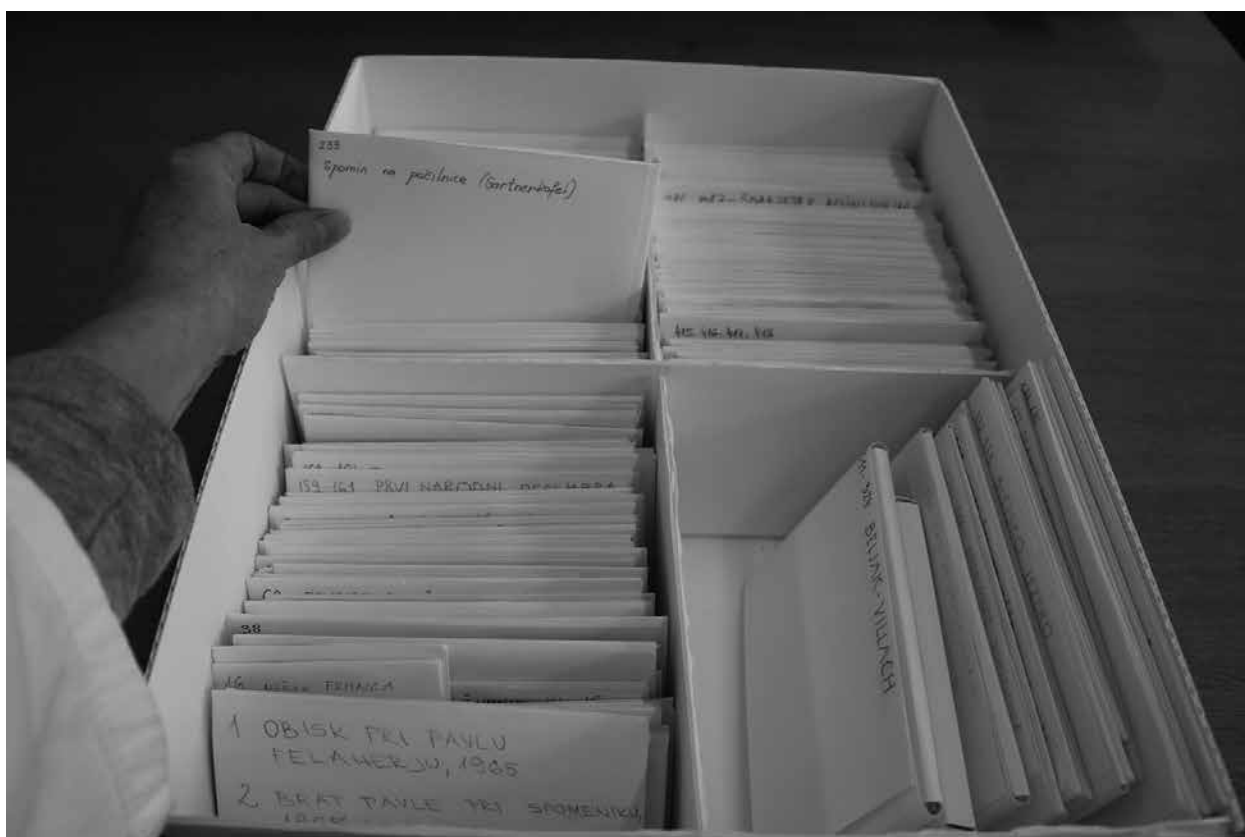
Figure 6: An open archival box made of durable paper with handmade wrappings inside