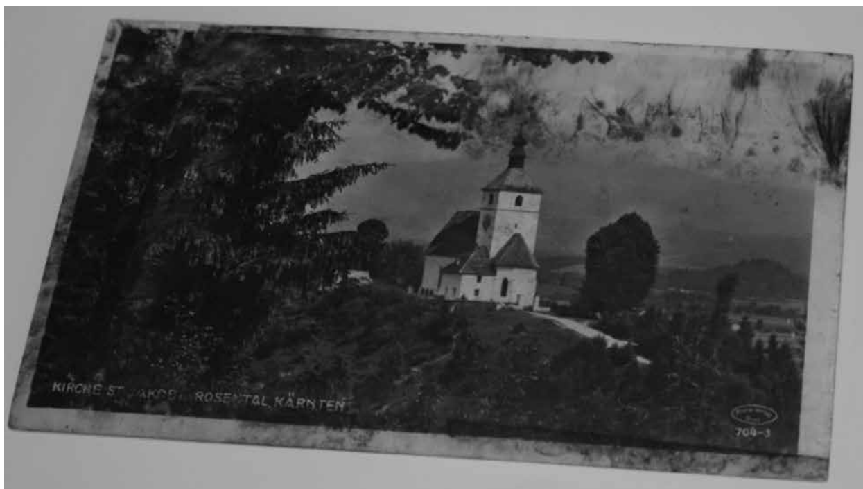
Figure 4: Mould on the front side of a silver gelatin black and white photograph dated 1931-1932, St. Jacob's Church, Rož / Rosental