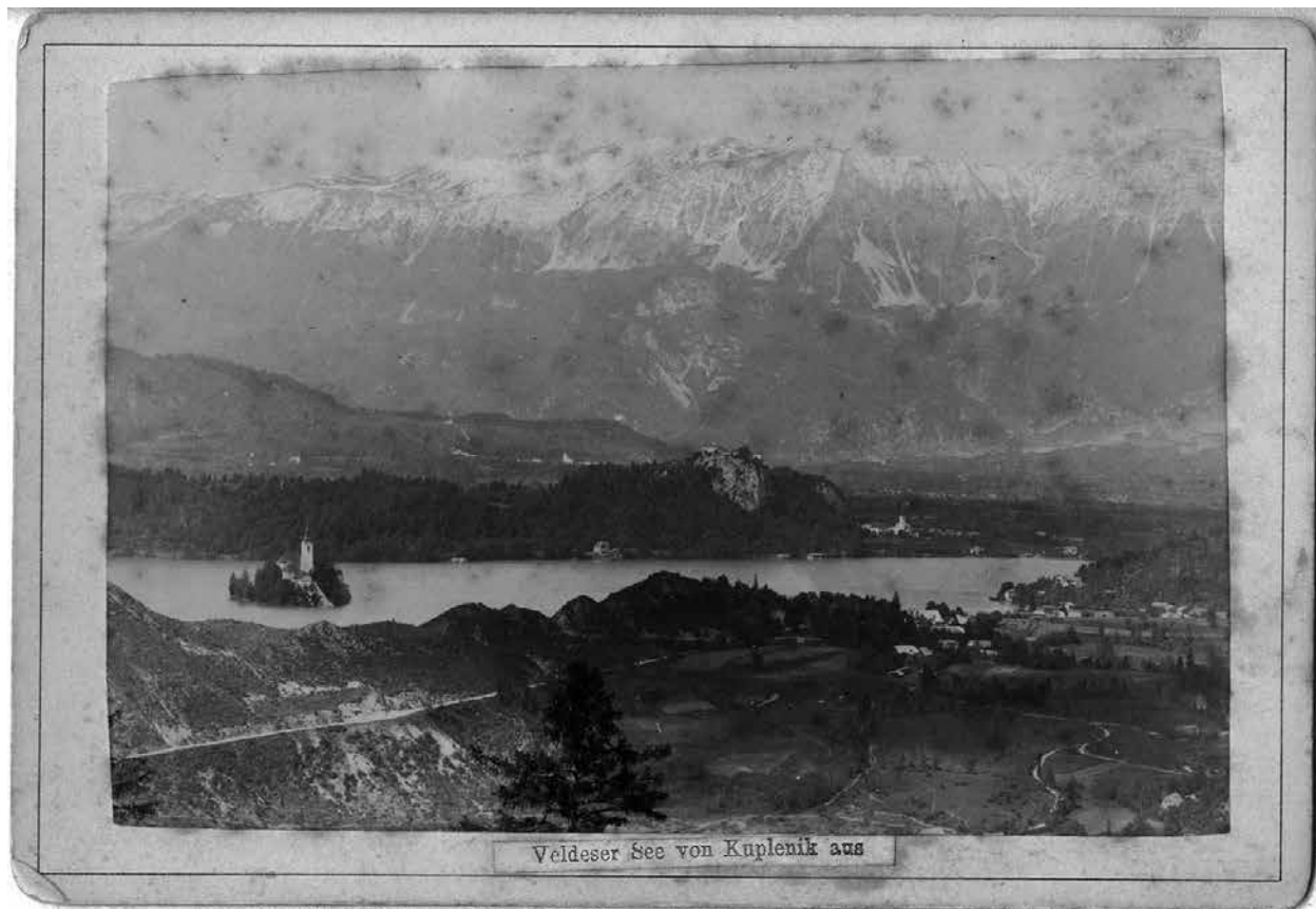
Figure 3: Foxing on the front and back side of an albumen photograph from the end of the 19 th century, view of Lake Bled

Foxing appears in old photographs as fine red-brown randomly dispersed stains on the paper primary support (see Fig. 3). Experts are still not absolutely certain why foxing occurs, but it is known that, like moulds, foxing appears in bright, warm and humid places.